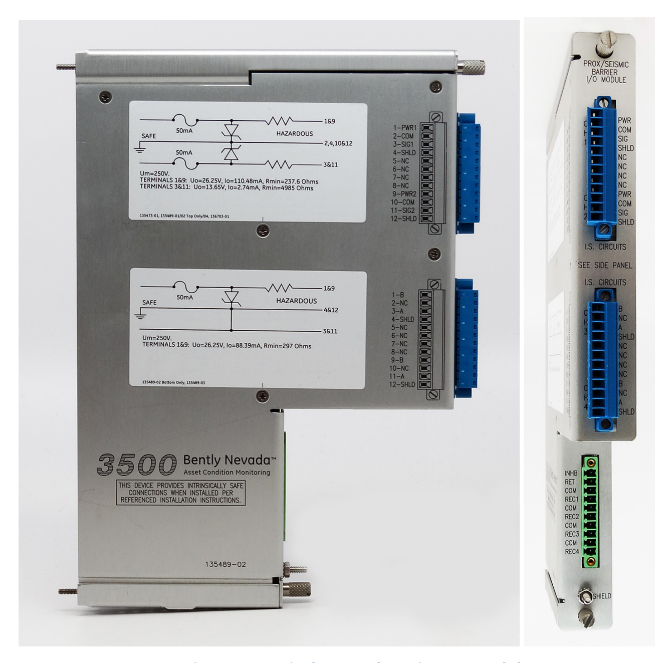
Figure 1: Typical Internal Barrier I/O Module